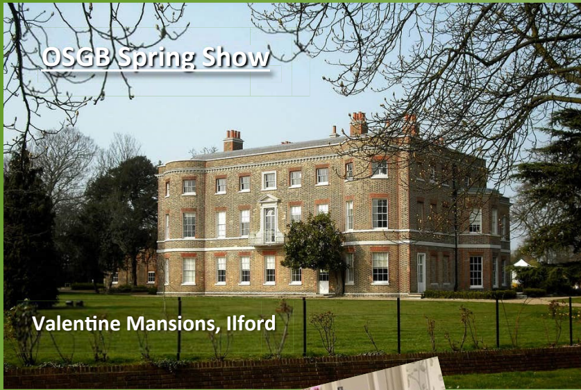
Valentine Mansions, Ilford