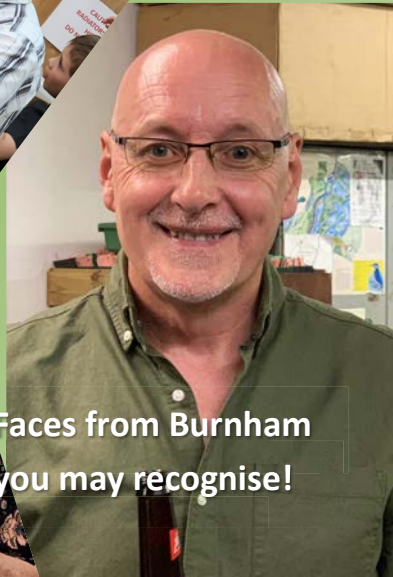
Faces from Burnham you may recognise!