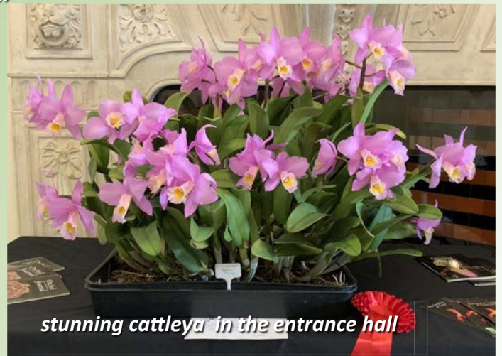
stunning cattleya in the entrance hall

A very successful show with over 400 visitors, including this very handsome trainee guide