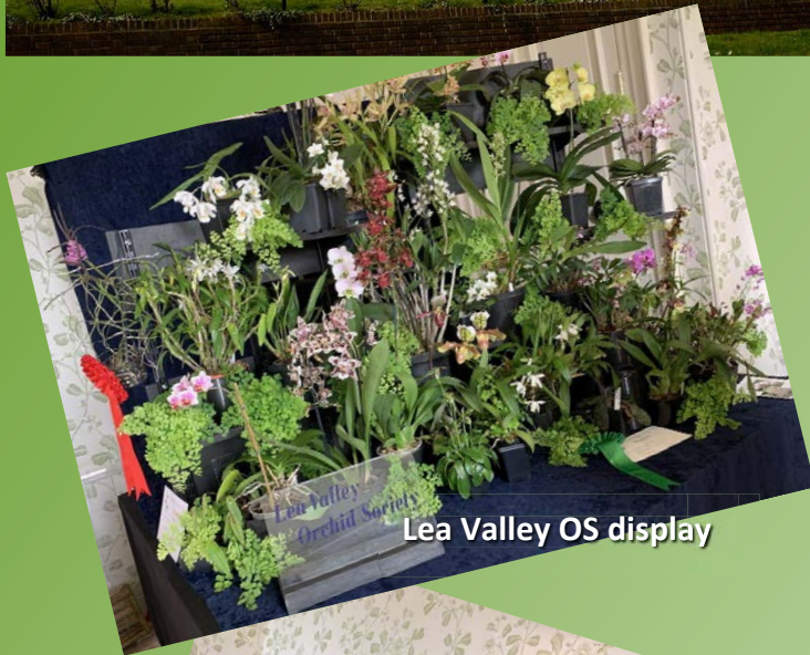
Lea Valley OS display