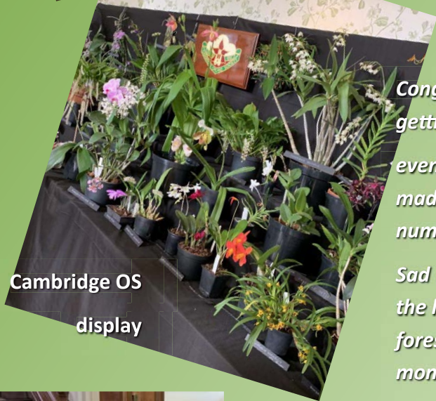
Cambridge OS display

Congratulations guys on getting the date right - even a week later would have made such a difference to numbers.