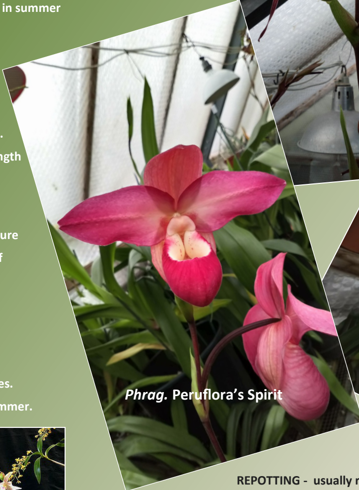
Phrag. Peruflora's Spirit